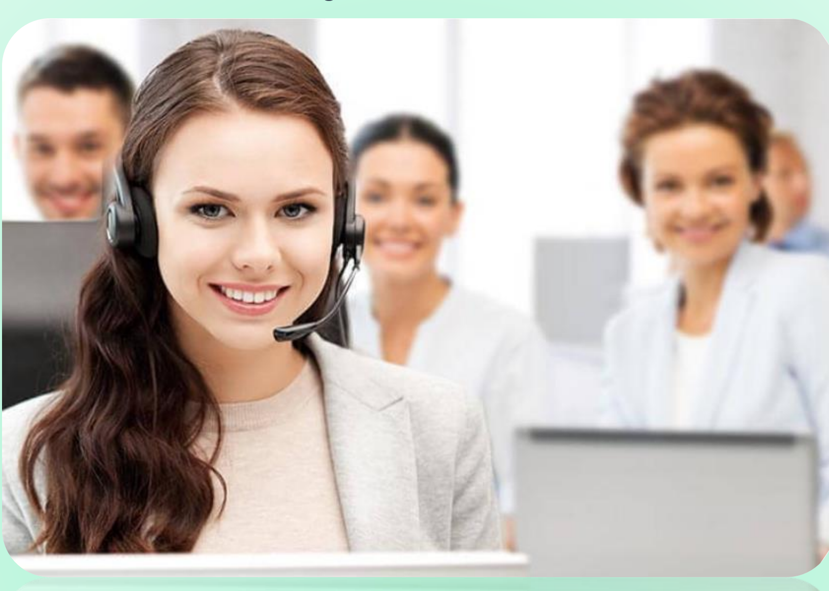
Sales & Customer Servicing Series

On paper, the main point of sales is selling a product or service in exchange for money. Customer service on the other hand is all about supporting people interested in your product or service, in order to increase customer satisfaction.